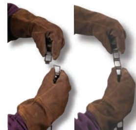
Drive Chain Links