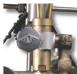
Graduated Bevel Collar