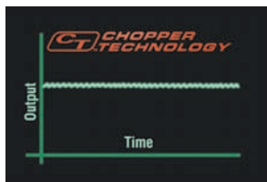
Chopper Technology® delivers extremely fast response for tighter output control.

Patented and award-winning Lincoln Electric Chopper Technology® delivers superior DC arc welding performance for general purpose stick, downhill pipe, DC TIG, MIG, cored-wire and arc gouging.