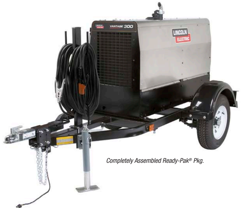
Completely Assembled Ready-Pak® Pkg.

K2453-3 Vantage® 300 Kubota® Ready-Pak® Package