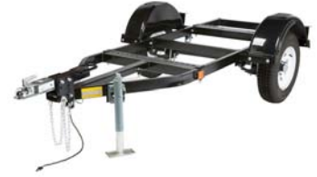
K2636-1 Medium Welder Trailer