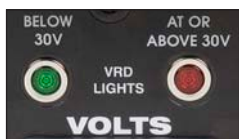
VRD™ portion of nameplate with green light on.