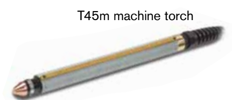
T45m machine torch