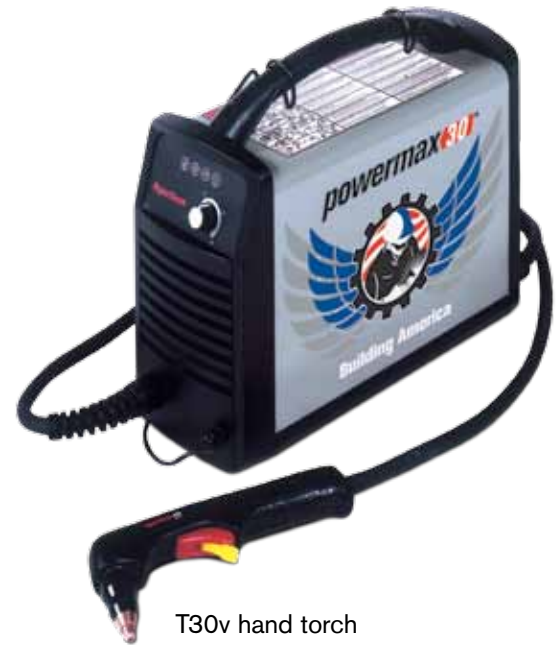
T30v hand torch